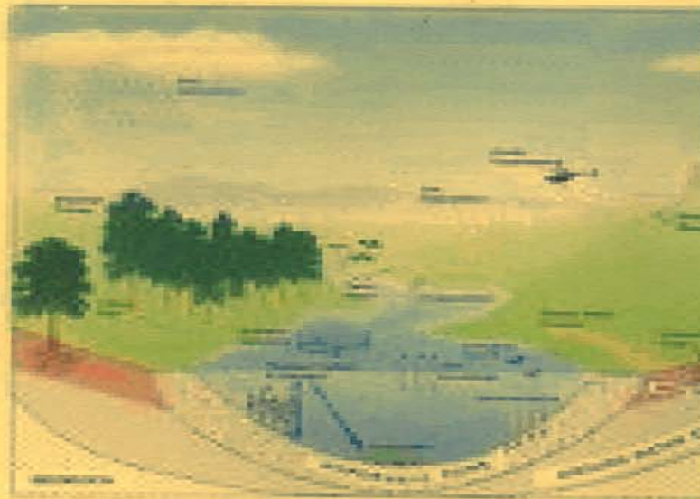
Figure 1: A diagram of a wastewater treatment plant, showing some of the various stages of treatment. The diagram is labeled with various parts of the plant, including 'Influent', 'Aeration', 'Settling', 'Sludge', and 'Effluent'. The background is a light blue sky with some clouds.

This job is very enjoyable and you get the feeling of happiness when you make a difference in this world by helping the environment. You also get to travel around the world! A good place to start this job is downtown Salt Lake City. The air is full of pollution from factories, and recycling is critical to mother earth. So get a job as an ENVIRONMENTAL ENGINEER TODAY!